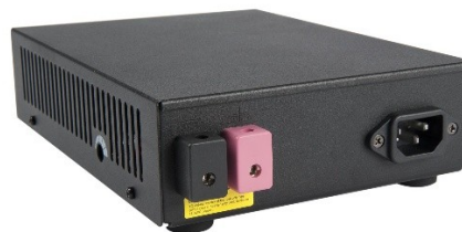
Astron Switching Supply

If you require continuous relatively high current draws, be sure to consider the connectors on the supply. Just because a supply is rated at 35 amps does not mean that all of the components can handle that in continuous duty.