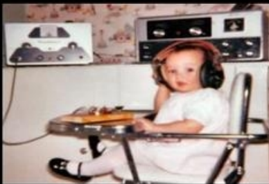
WHAT MY WIFE THINKS I DO