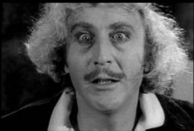
WHAT MY KIDS THINK I DO