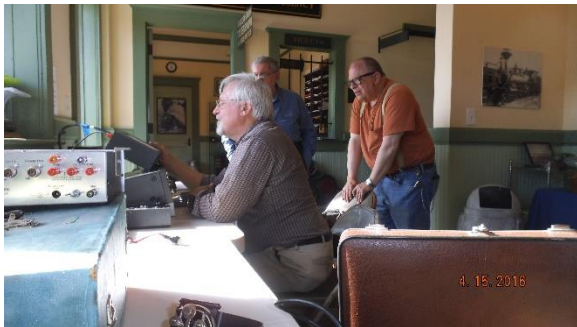
WA4FEH & KD4CMK