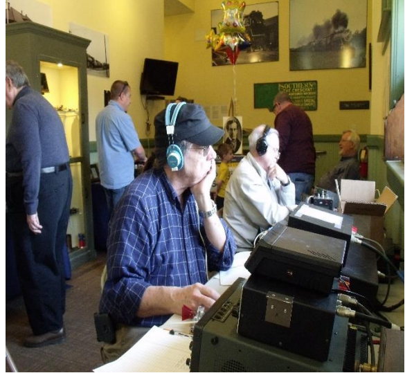
KJ4IT & WA1UQO